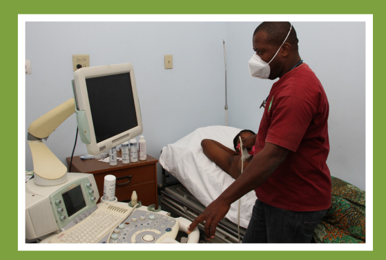
St. Luke Family Hospital