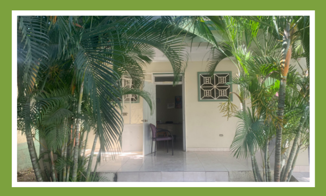
Manitane Women's Health Center provides care to more than 2,500 mothers each year, focusing on pre-natal visits and counseling, along with cervical cancer screening.

It has been three years since St. Luke took over the management of this clinic. In 2020, KTNY welcomed 7,051 pediatric consults. 280 malnourished children were treated at our Malnutrition Center. The clinic also vaccinated 5,013 young people and served as a Covid-19 education and prevention resource for the community.