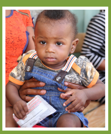
Families visit the Kay O Bwa Nutrition Center, which delivers education and nutritional supplements to support community health and wellness.